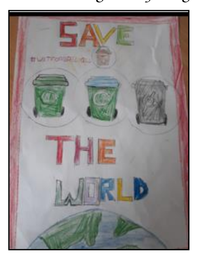
Nuredin's poster To encourage recycling