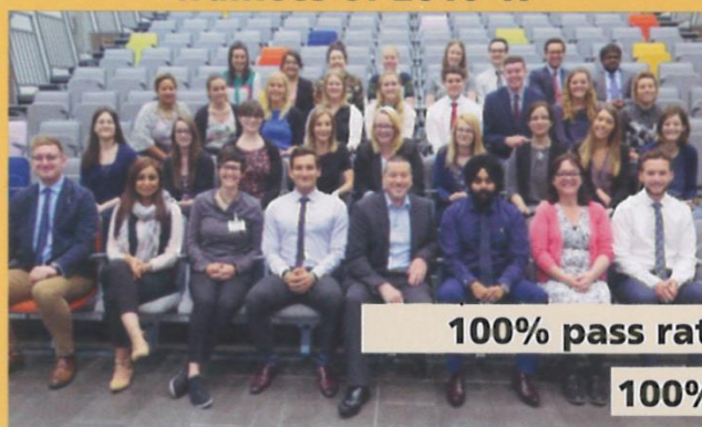
Trainees of 2016-17