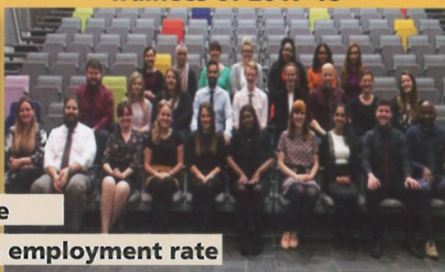
Trainees of 2017-18