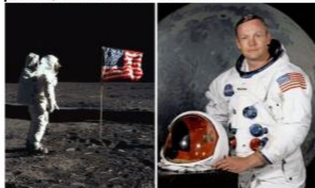
Neil Armstrong: The first astronaut to ever walk on the moon.

So today, we'll talk about Neil's Journey, of how he became a man of the future.